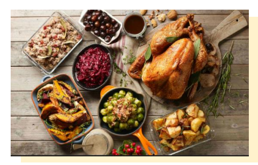
Add to Catering Menu