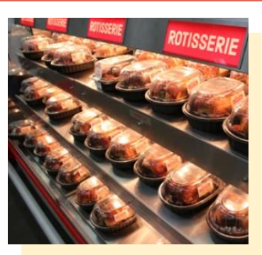
With Rotisserie Chicken