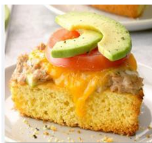
Cornbread Tuna Melt