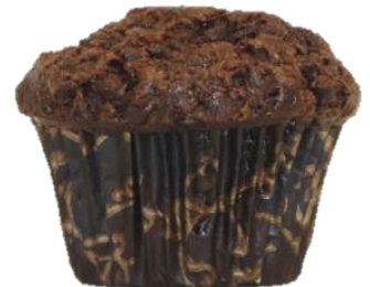
Triple Chocolate topped with chips