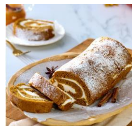
Pumpkin Swiss Roll