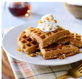
Carrot Raisin Waffles

Use UltraMoist batters to make the highest quality muffins, cornbread and loaf cakes then explore endless recipe possibilities! Visit our website for recipe ideas on how to transform a muffin at breakfast to a dessert for dinner and make appetizers, center plate inclusion and so much more!