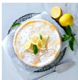
Lemon Ricotta Cake