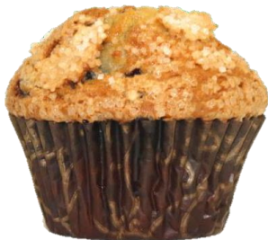
Blueberry topped with Sugar

Gross Case Weight: 4.63 Lb. Net Case Weight: 3.75 Lb. Dimensions: 16.4 x 12.4 x 4.4 Ti/Hi: 8 x 17 Cube: .52 Cf Storage: 0° or below Shelf Life Frozen: 364 days Shelf Life Ambient: 7 days