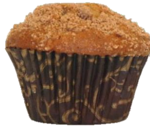
Cinnamon Coffee Cake topped with cinnamon streusel