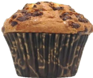
Chocolate Chip topped with chips