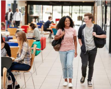
Colleges & Universities