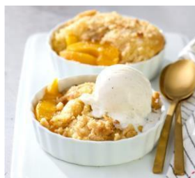
Peaches & Vanilla Cream Cobber