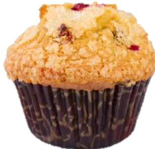
Cranberry Orange topped with Sugar