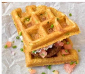
Corn Waffle Sandwich

Visit bakenjoy.com/recipes for more menu expanding ideas!