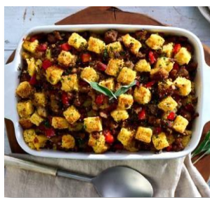
Cornbread Sausage & Sage Stuffing