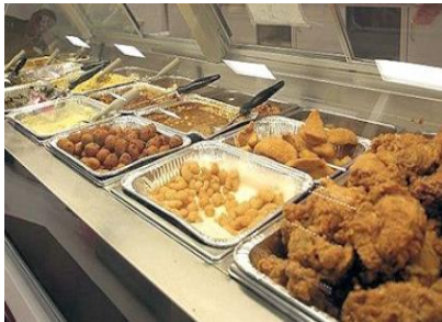
Near Hot Service Counter