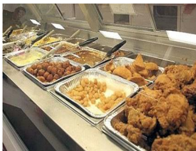
Near Hot Service Counter