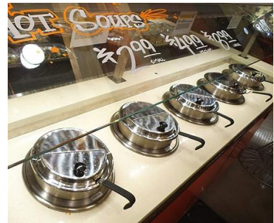
Near the Soup Station