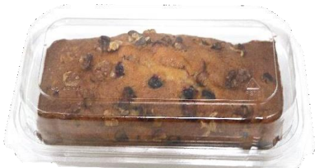
Cranberry Nut with Nuts