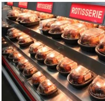
With Rotisserie Chicken