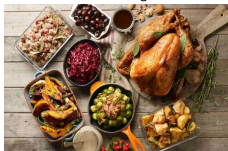
Add to Catering Menu