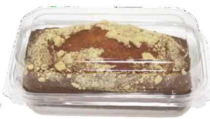
French Vanilla with Butter Streusel