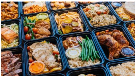
Alongside Prepared Meals