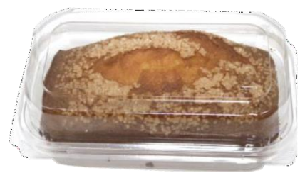
Lemon with Sugar