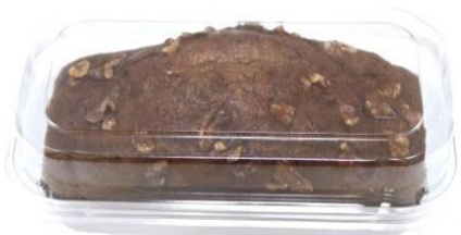
Banana Nut with Nuts