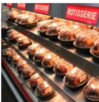
With Rotisserie Chicken