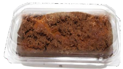
Pumpkin with Cinnamon Streusel