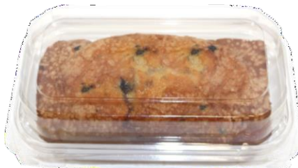
Blueberry with Sugar