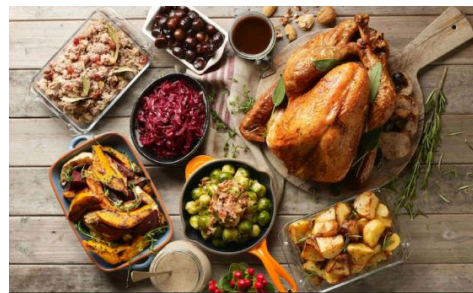
Add to Catering Menu