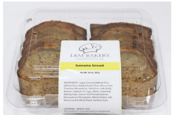
Packaged 14 oz. Sliced Loaves