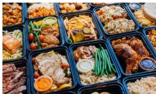
Alongside Prepared Meals