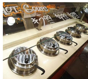
Near the Soup Station