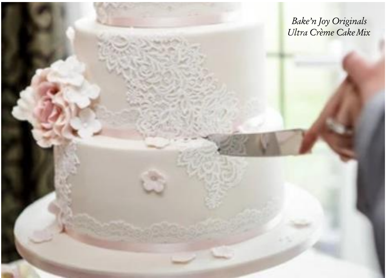
Bake'n Joy Originals Ultra Crème Cake Mix